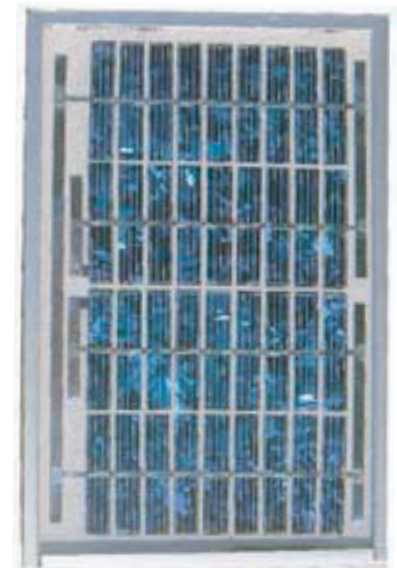
Power Up 2 Watt Module